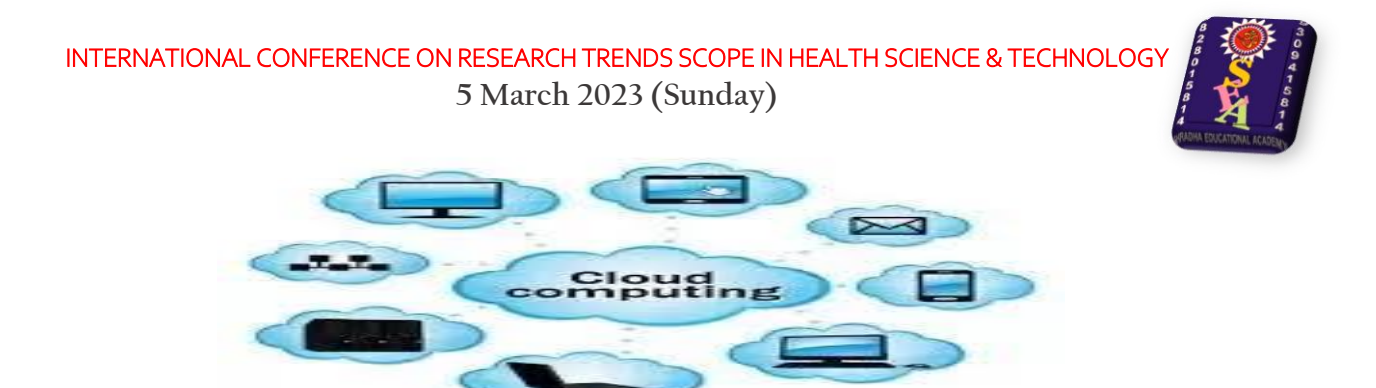
Figure 2: Cloud Computing