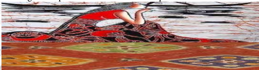
Contemporary Aipan Art Used in Batik

Batik is a very important technique as it lays the foundation for all the other printing techniques. Batik technique offers enormous potential outcomes for a creative opportunity as patterns are drawn instead of by weaving with string. It is also one of the oldest known printing techniques so it will always have a great impact on the modern techniques