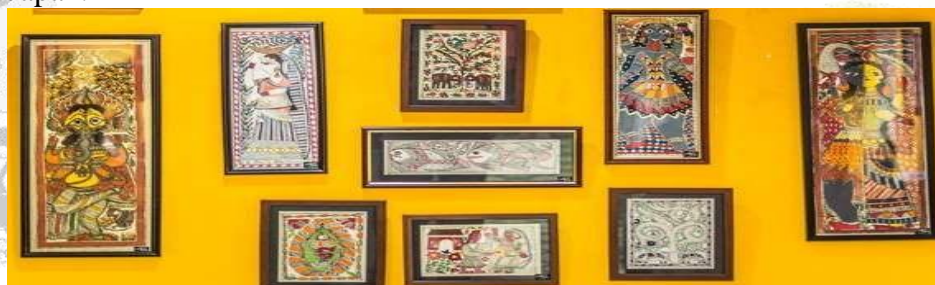
Modern Madhubani Paintings