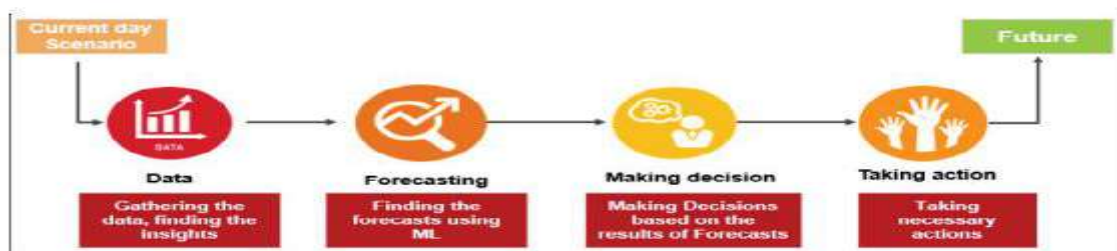
Figure 1.2: The Process of Sales Forecasting in a Business Environment

The process of making sales projections can have an effect on a wide range of organizational tasks, such as financial planning, marketing, customer management, and a number of other domains. As a direct consequence of this, improving the precision of sales estimates has emerged as a critical component that must be met for a company to successfully run its business. This is just one example of how time series forecasting can be put to use. It is becoming increasingly popular to utilize data from the past in time series forecasting as the basis for the operation of any activity over the course of time.