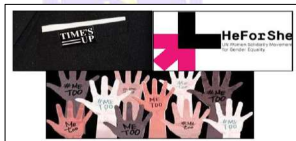
Fig 4: campaigns started by women

These are some steps which companies can take to avoid gender discrimination and these steps will improve the working environment for every employee.