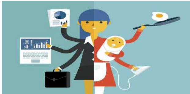
Fig 2: Challenges for women