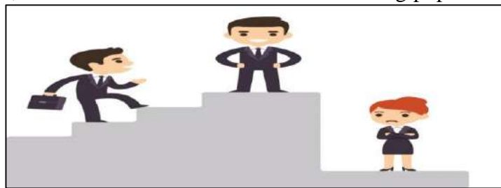
Fig 1: Gender discrimination at workplace

According to the study, 72% women feels gender discrimination in their organizations and in the last 25 years, there has been decline in female working population.