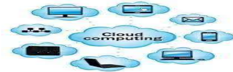
Figure 2: Cloud Computing