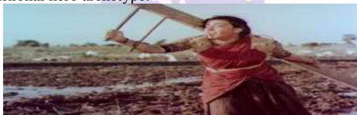
Fig. 2 : Timid To Bold: Bollywood's Portrayal Of Women Changed Over Years

Amitabh Bachchan's emergence as a leading actor in the 1970s brought about a revolutionary change in Bollywood's narrative and style. Films like "Zanjeer" (1973) and "Deewar" (1975) showcased him as the 'angry young man,' a character who rebelled against societal injustices and corruption. This persona resonated with the frustrations of the youth and reflected their desire for change. Bachchan's powerful performances and intense characters added a new dimension to Bollywood cinema, and his popularity redefined the traditional hero archetype.