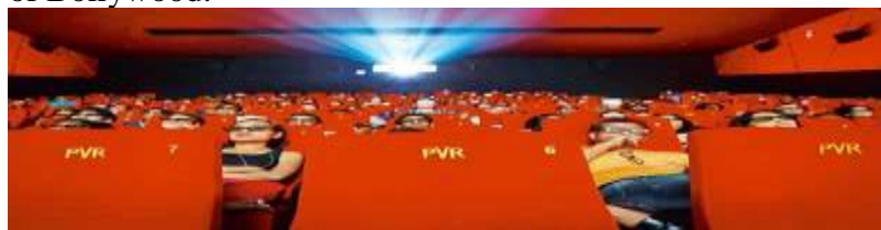
Fig. 4 : Liberalization of the Bollywood

1. Globalization and Economic Liberalization: The 1990s marked a significant turning point for India's economy with economic liberalization, which led to greater international engagement and trade. This opening up of the economy had an impact on Bollywood as well. The industry began to explore international collaborations, and Indian films gained wider exposure on the global stage. This era saw an increase in the diaspora audience, especially in countries with significant Indian populations, contributing to the globalization of Bollywood.