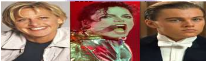
Fig. 3 : Most influential pop culture moments since 1990

The 1980s heralded the era of mainstream commercial cinema with larger-than-life heroes, spectacular dance sequences, and melodramatic plots. The quintessential masala film like "Sholay" (1975) and the charm of stars like Sridevi and Rajesh Khanna defined this period. Escapism provided respite from political turmoil, while evolving urbanization was subtly depicted in narratives.